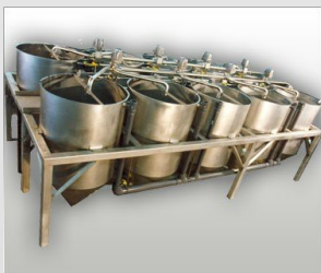
Tank Farms, Corn Soak Systems