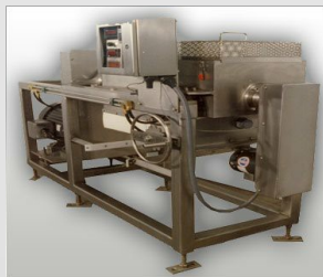
Corn Mill Grinder