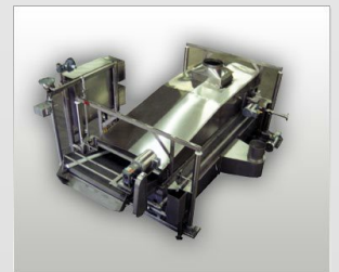
Direct Fired Fryer for Extruded Products

Project Management • Engineers • Fabricators • Installers