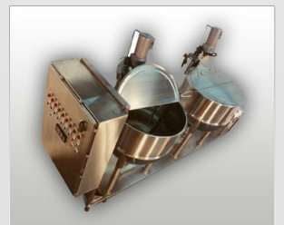
Mixing Use Tank Skid

Project Management • Engineers • Fabricators • Installers