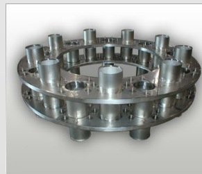
Silo Scale Hopper Infeed Distributor