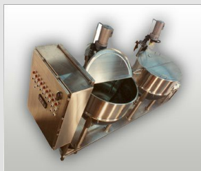
Mixing Use Tank Skid