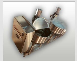
Mixing Use Tank Skid

Project Management • Engineers • Fabricators • Installers