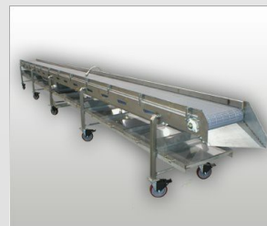
Sanitary Process Conveyor