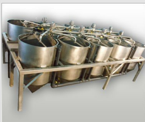
Tank Farms, Corn Soak Systems