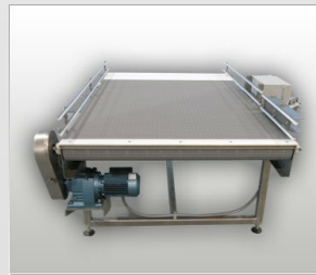
Accumulation & Surge Conveyor