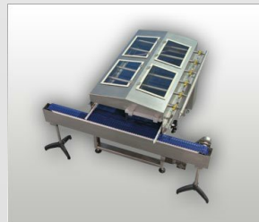
Bottle Cooling Tunnel