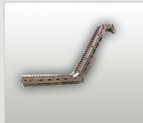
Custom Incline Conveyors