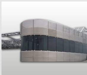
Architectural Metal Facades