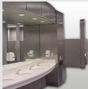
Stainless Steel Architectural Trim