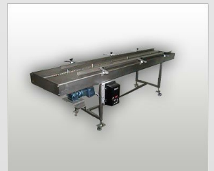
Lug Packaging Infeed Conveyor

Project Management • Engineers • Fabricators • Installers