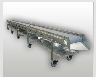
Sanitary Process Conveyor

Project Management • Engineers • Fabricators • Installers