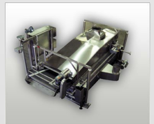
Direct Fired Fryer for Extruded Products

Project Management • Engineers • Fabricators • Installers