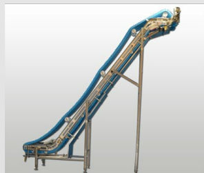
Lift & Speed Clean Conveyor System