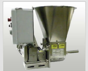
Seasoning Powder Feeders

Project Management • Engineers • Fabricators • Installers