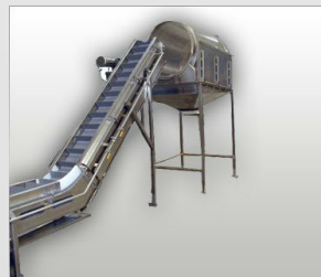
Seasoning Tumbler with Incline Conveyor