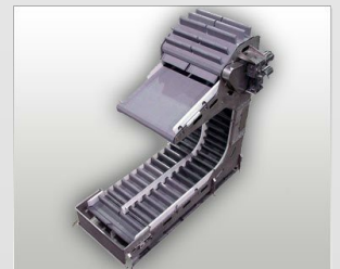
Vertical Captiveor, C-Frame Conveyor

Project Management • Engineers • Fabricators • Installers