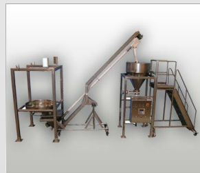
Bulk Bag Delivery Systems