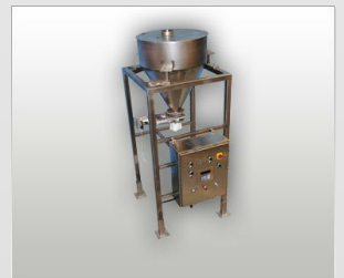
Hopper Weigh & Batch Systems

Project Management • Engineers • Fabricators • Installers