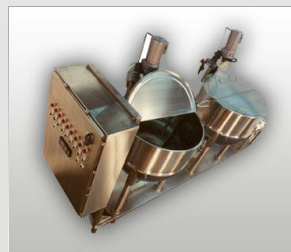
Mixing Use Tank Skid